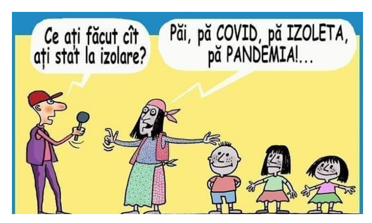
Figure 1 . Anthroponymic ethnic joke related to the coronavirus pandemic.

stereotypes about the Roma ethnic minority in Romania, i.e., that of Roma families having many children; 2) it is illustrative of a name-giving tendency characteristic of this ethnic group, i.e., the use of antonomasia (see Felecan, O. 2014a: 510).