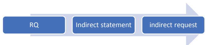
Figure 1: RQs as indirect requests

While RQs typically function on a two-layer basis (a question represents an indirect statement), the question in the example (2) has the third component, with the implied statement functioning as an indirect request, as shown in Figure 1: